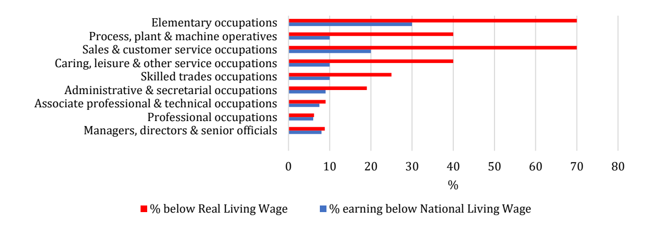
Figure 3: Percentage below selected low pay thresholds, by occupation, 2018

In terms of occupation, as shown in Figure 3 the occupations with the highest proportion of low paid workers include those in Sales & Customer service and Elementary occupations. Some 70% of these workers earned below the Real Living Wage, whilst 30% of workers in Elementary occupations and 20% of workers in Sales & Customer service occupations earned below the National Living Wage.